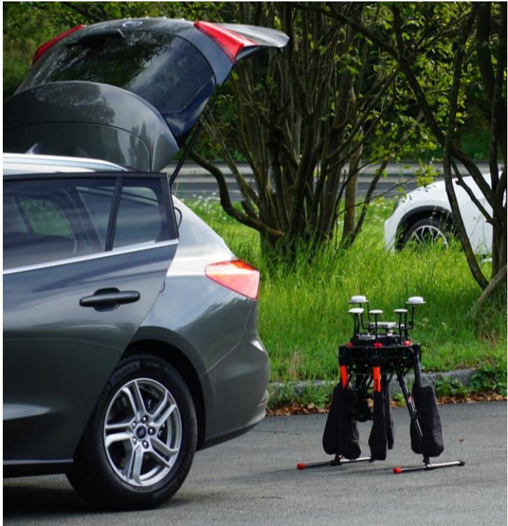
Data collection for an orthophoto